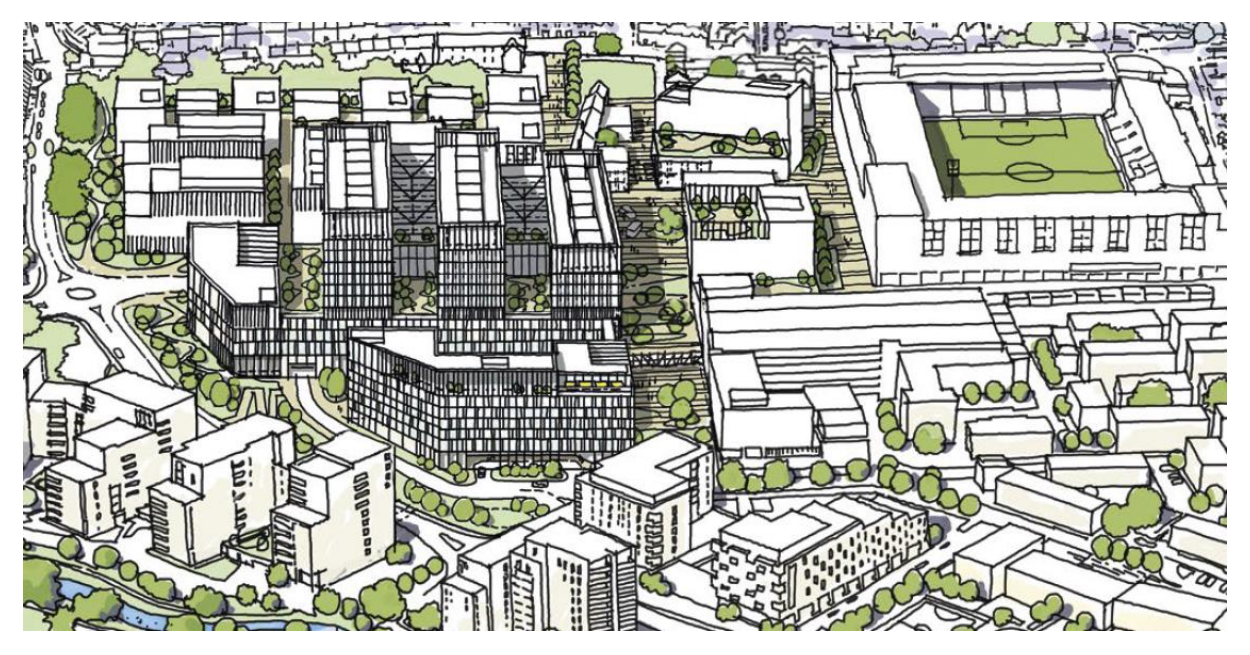
2021 – the Trust's plan for new hospital buildings at Watford. The darker buildings in the middle are the hospital, with residential and retail development surrounding it. Some space is earmarked at the top of the picture for hospital expansion

See the drawing below, produced by the Trust to illustrate its 2021 plans for its current preferred option, which shows roughly the equivalent area to the drawing above, though from a different angle. Under these latest plans there would be some limited scope for further expansion of the hospital estate, but the main change is that, instead of medium-rise buildings as planned in 2014, the aim now is to build high, with minimal landscaping between the blocks. A further challenge will come if the suggested move of the Mount Vernon Cancer Centre from Northwood to a site between the existing main clinical buildings and the Watford FC ground takes place.